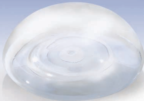
Ultra High Profile